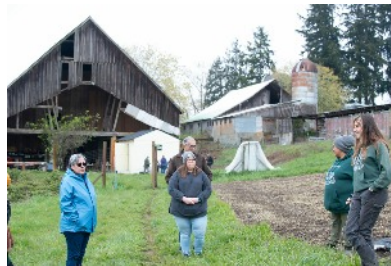
Planting potatoes with our Nisqually Community Garden Crew Members.