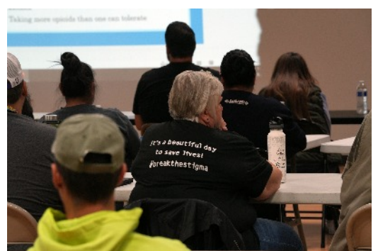
Employees all received Naloxone aka Narcan as part of the training.