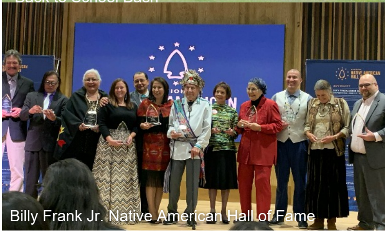
Billy Frank Jr. Native American Hall of Fame