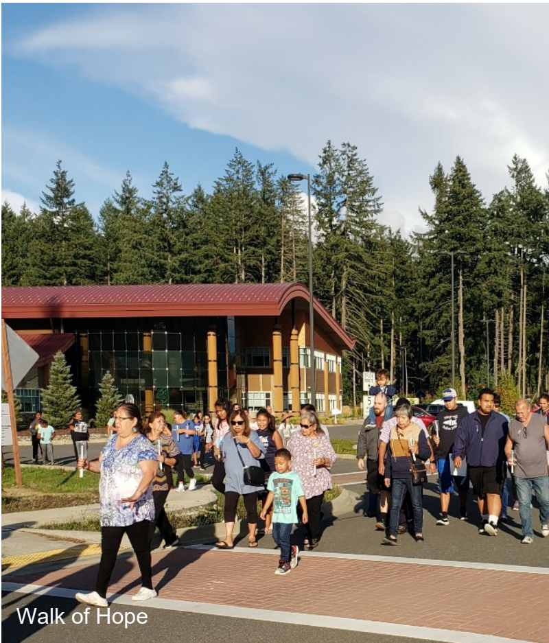
Walk of Hope