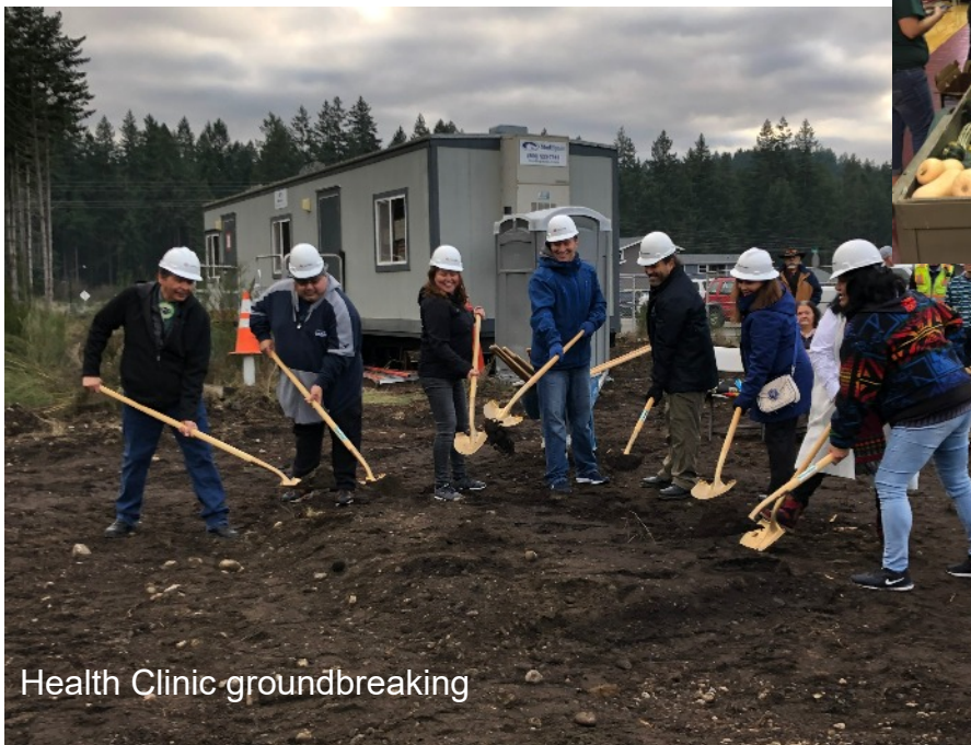
Health Clinic groundbreaking