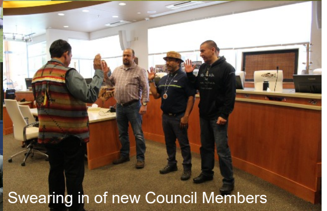
Swearing in of new Council Members