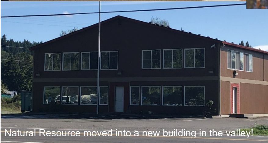
Natural Resource moved into a new building in the valley!