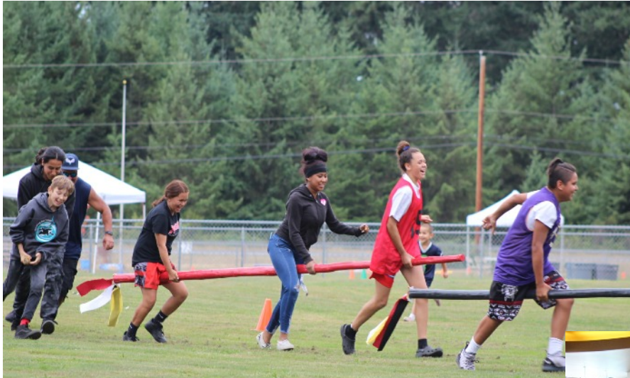
Back to School Bash