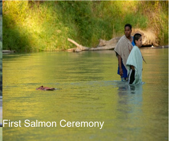
First Salmon Ceremony