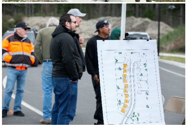
Anyone who wanted to be a part of the official turning of dirt grabbed a shovel. Canoe family and tribal council members. Building Department drawing shows the location of the 10 homes. Some of the footings with a view toward other housing off Journey Road.